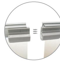
magnetic top clamp connector