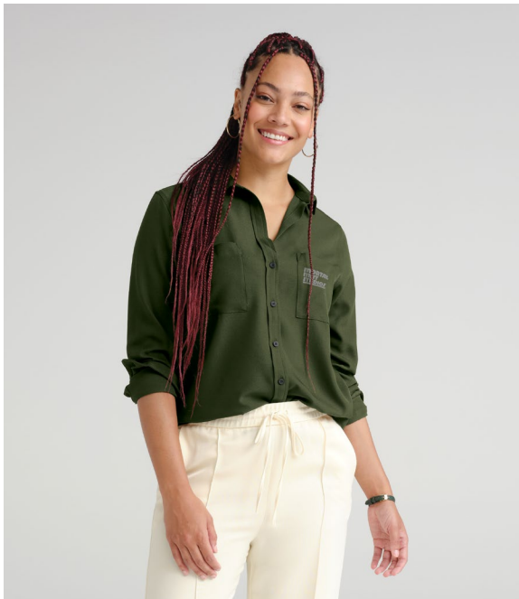
MERCER + METTLE Women's Stretch Crepe Long Sleeve Camp Blouse MM2013 Women's Sizes: XS-4XL | 4 colors