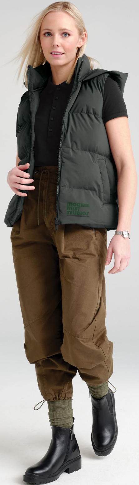
MERCER + METTLE Women's Stretch Heavyweight Pique Polo MM1001 Women's Sizes: XS-4XL | 8 colors