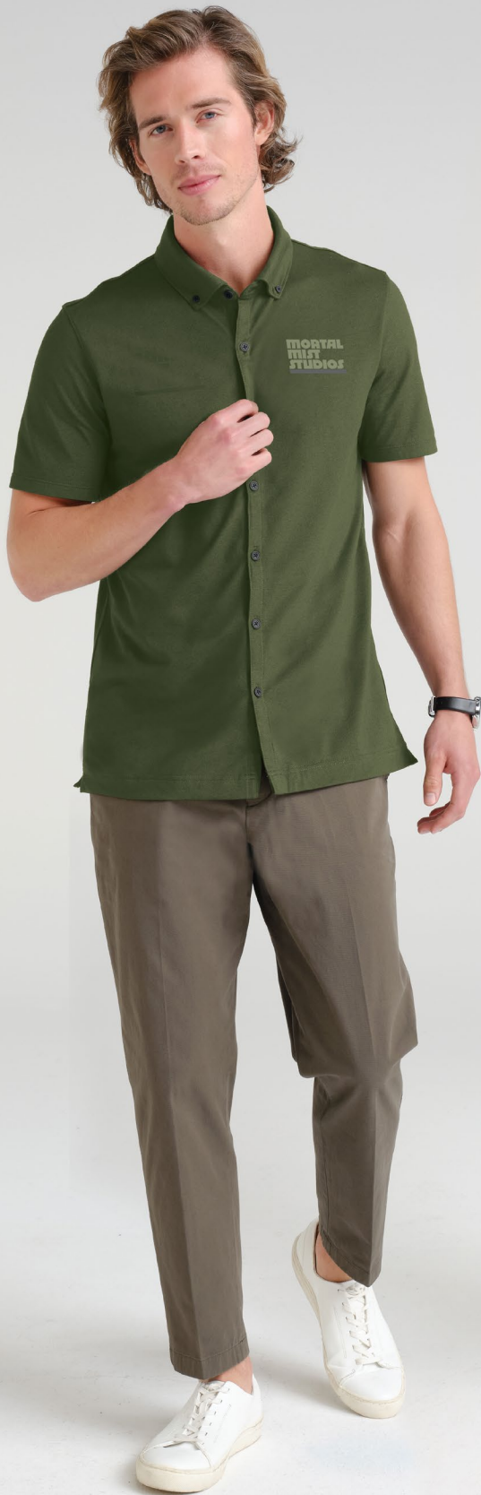
MERCER + METTLE Stretch Pique Full-Button Polo MM1006 Adult Sizes: XS-4XL | 7 colors