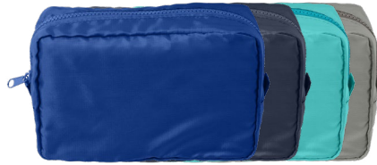
PORT AUTHORITY Stash Dimensional Pouch BG916 6 colors