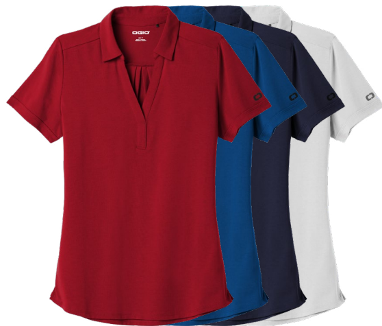
OGIO Ladies Limit Polo LOG138 Women's Sizes: XS-4XL | 7 colors