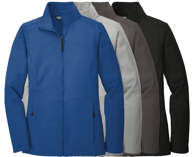
PORT AUTHORITY Ladies Collective Soft Shell Jacket L901 Women's Sizes: XS-4XL | 5 colors