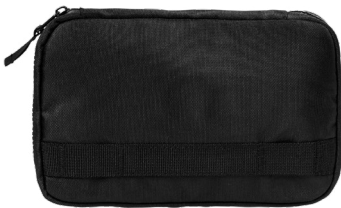
MERCER + METTLE Utility Case MMB700 1 color