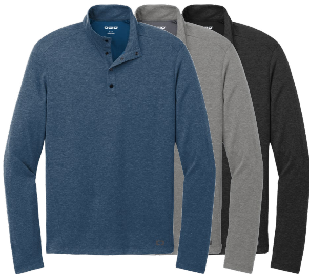
OGIO Command 1/4-Snap OG151 Adult Sizes: XS-4XL | 3 colors