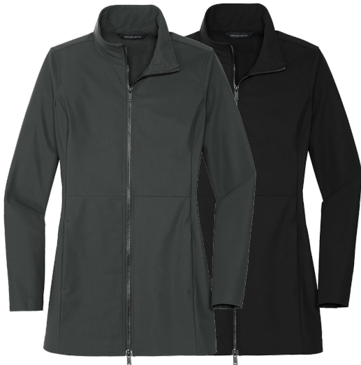
MERCER + METTLE Women's Faillie Soft Shell MM7101 Women's Sizes: XS-4XL | 2 colors