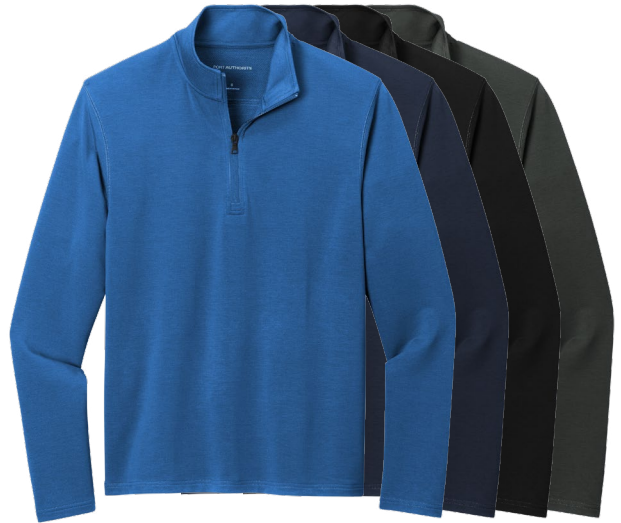
PORT AUTHORITY Microterry 1/4-Zip Pullover K825 Adult Sizes: XS-4XL | 4 colors