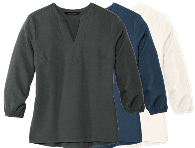
MERCER + METTLE Women's Stretch Crepe 3/4-Sleeve Blouse MM2011 Women's Sizes: XS-4XL | 5 colors