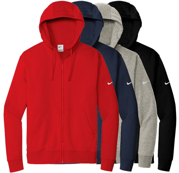
NIKE Club Fleece Sleeve Swoosh Full-Zip Hoodie NKDR1513 Adult Sizes: XS-4XL | 6 colors