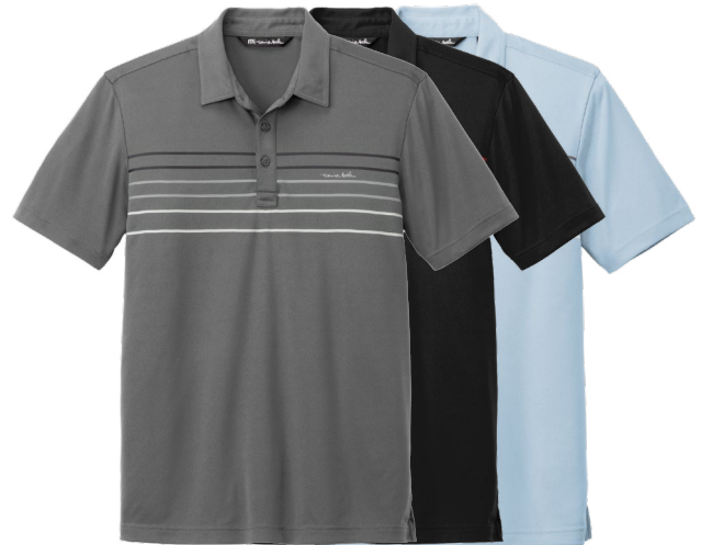
TRAVISMATHEW Coto Performance Chest Stripe Polo TM1MY400 Adult Sizes: S-3XL | 3 colors