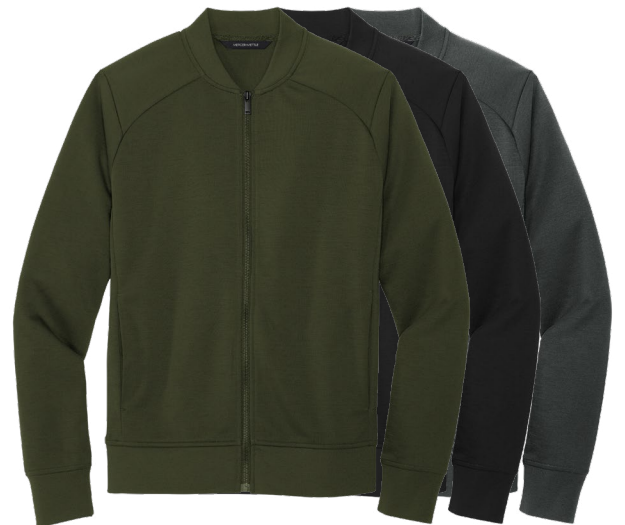
MERCER + METTLE Double-Knit Bomber MM3000 Adult Sizes: XS-4XL | 4 colors