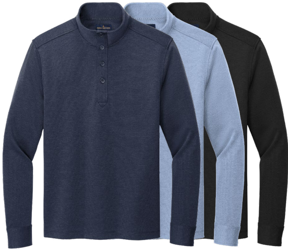
BROOKS BROTHERS Mid-Layer Stretch 1/2 Button BB18202 Adult Sizes: XS-4XL | 5 colors