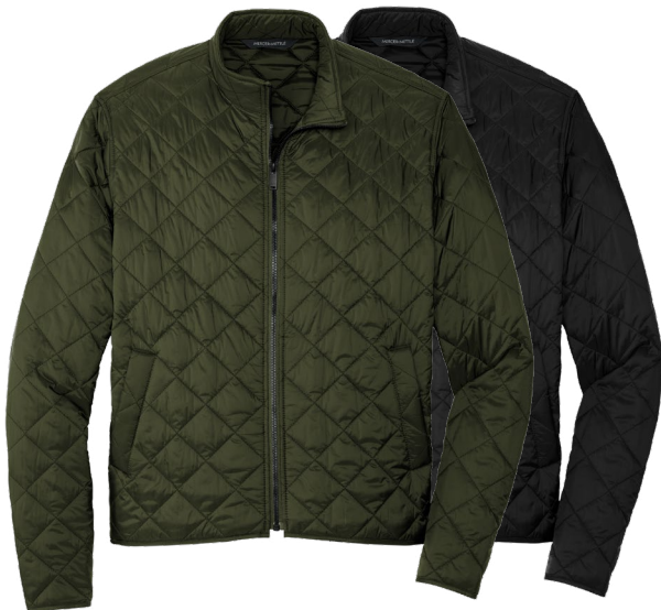
MERCER + METTLE Quilted Full-Zip Jacket MM7200 Adult Sizes: XS-3XL | 2 colors