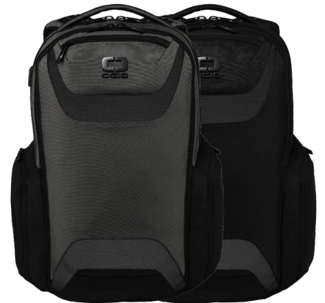
OGIO Connected Pack 91008 2 colors