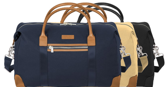
BROOKS BROTHERS Wells Duffel BB18880 3 colors

Heat Transfer is the most effective technique for these styles