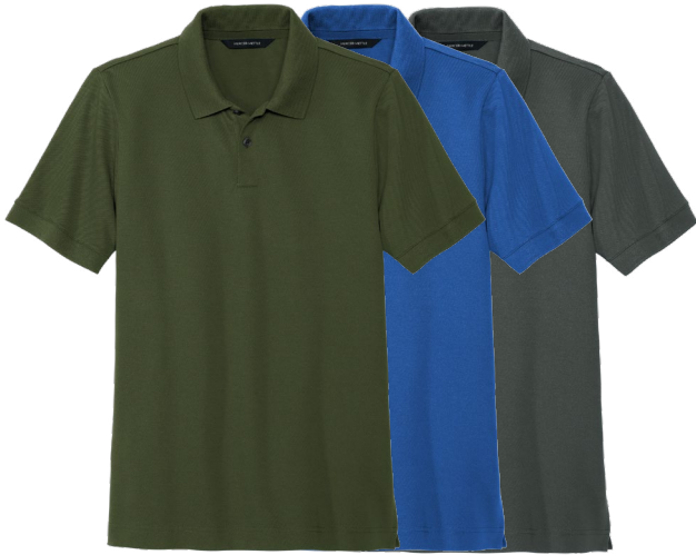
MERCER + METTLE Stretch Heavyweight Pique Polo MM1000 Adult Sizes: XS-4XL | 8 colors