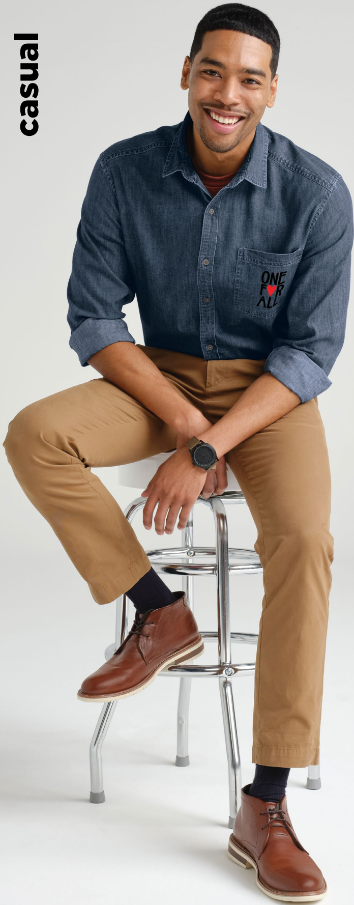
PORT AUTHORITY Long Sleeve Perfect Denim Shirt W676 Adult Sizes: XS-4XL | 2 colors