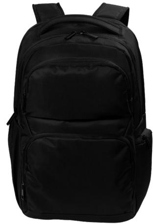
PORT AUTHORITY Transit Backpack BG224 1 color