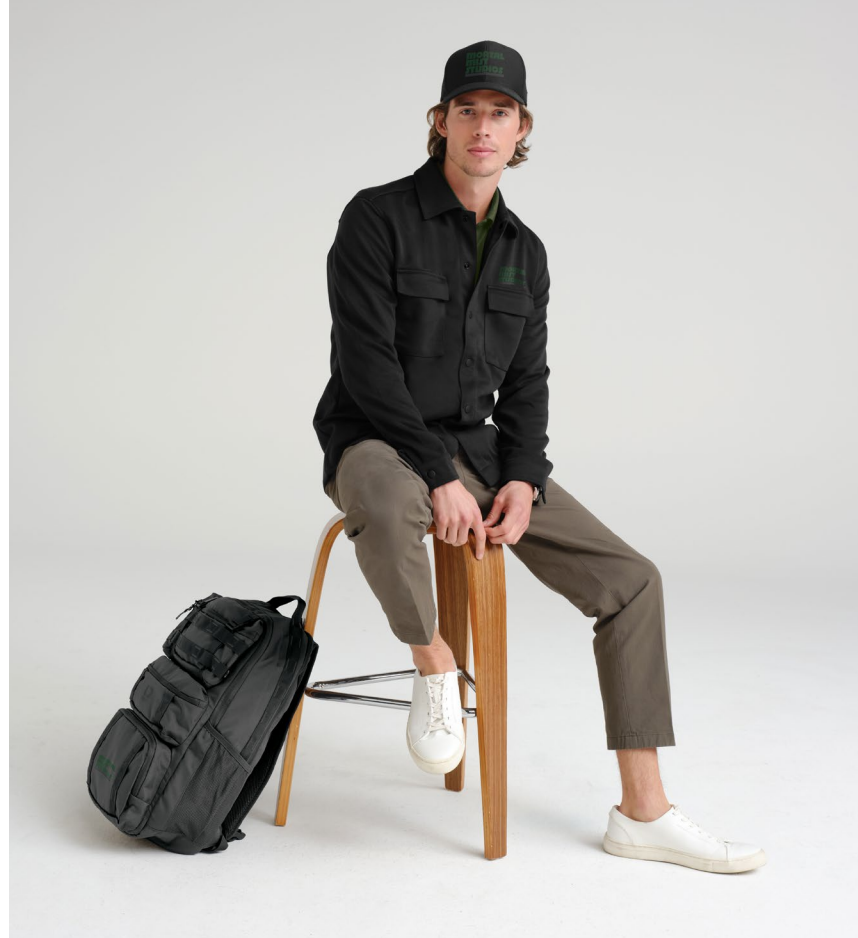
OGIO Utilitarian Modular Pack 91018 2 colors