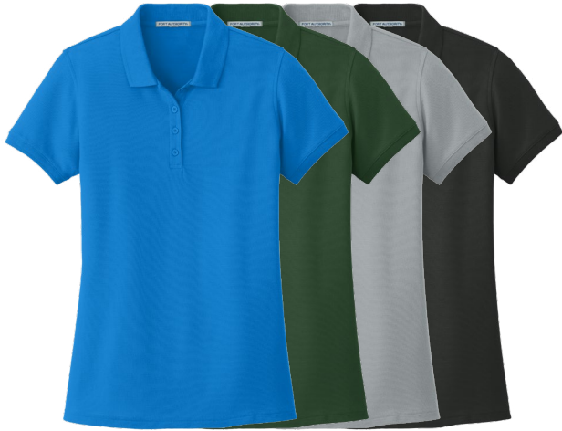
PORT AUTHORITY Ladies Core Classic Pique Polo L100 Women's Sizes: XS-6XL | 13 colors