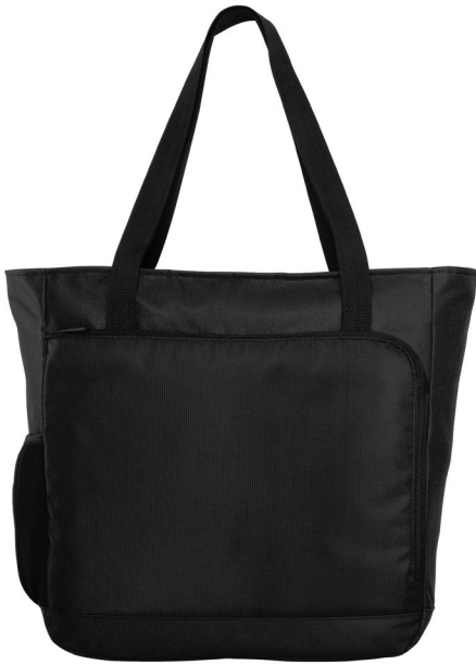
PORT AUTHORITY City Tote BG422 1 color