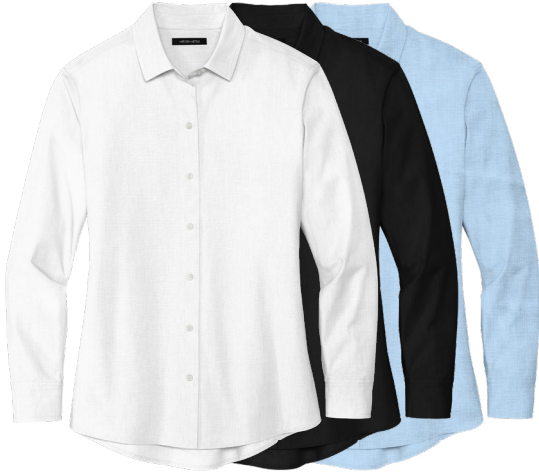
MERCER + METTLE Women's Long Sleeve Stretch Woven Shirt MM2001 Women's Sizes: XS-4XL | 4 colors