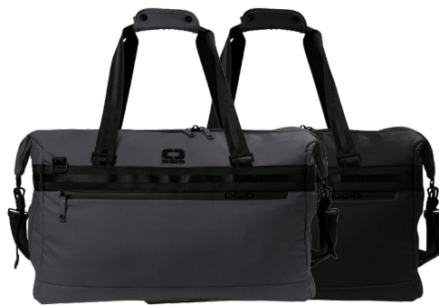
OGIO Commuter Duffel 411098 2 colors