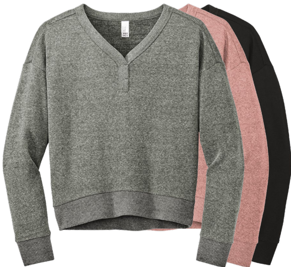
DISTRICT Ladies Perfect Tri Fleece V-Neck Sweatshirt DT1312 Women's Sizes: XS-4XL | 5 colors