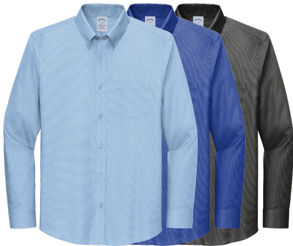
BROOKS BROTHERS Wrinkle Free Stretch Nailhead Shirt BB18002 Adult Sizes: XS-4XL | 6 colors