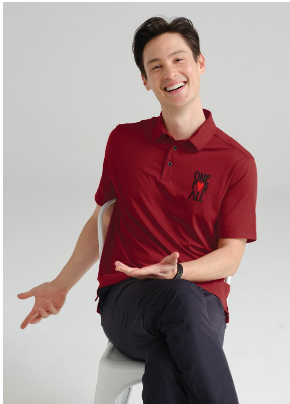
PORT AUTHORITY City Stretch Polo K682 Adult Sizes: XS-4XL | 6 colors