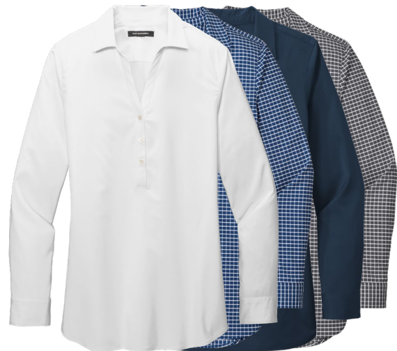
PORT AUTHORITY Ladies City Stretch Tunic LW680 Women's Sizes: XS-4XL | 5 colors