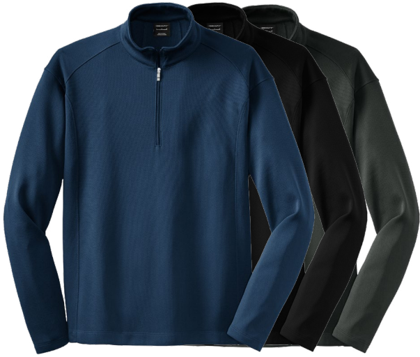
NIKE Sport Cover-Up 400099 Adult Sizes: XS-4XL | 3 colors