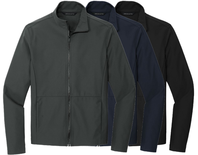
MERCER + METTLE Faillie Soft Shell MM7100 Adult Sizes: XS-4XL | 3 colors