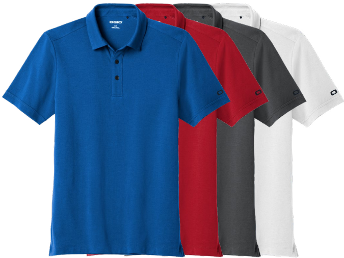
OGIO Limit Polo OG138 Adult Sizes: XS-4XL | 6 colors