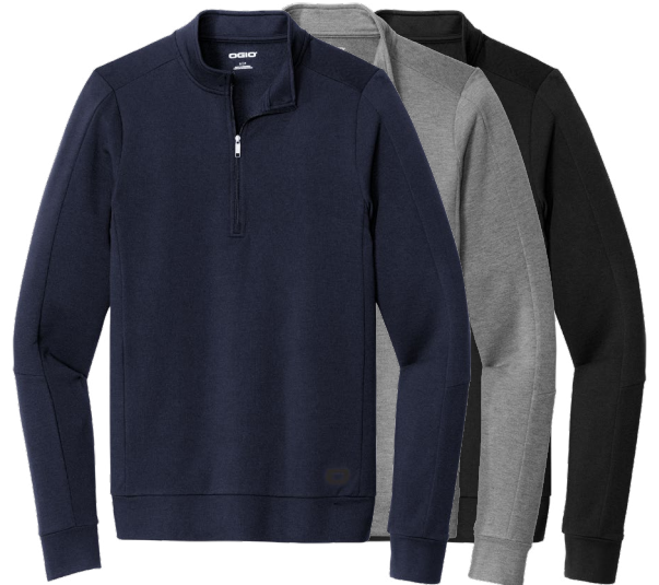
OGIO Luuma 1/2-Zip Fleece OG813 Adult Sizes: XS-4XL | 3 colors