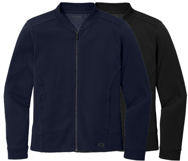
OGIO Ladies Hinge Full-Zip LOG820 Women's Sizes: XS-4XL | 3 colors