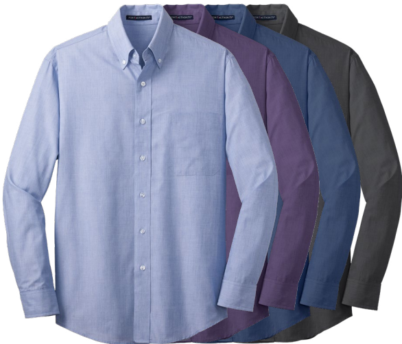
PORT AUTHORITY Crosshatch Easy Care Shirt S640 Adult Sizes: XS-4XL | 4 colors