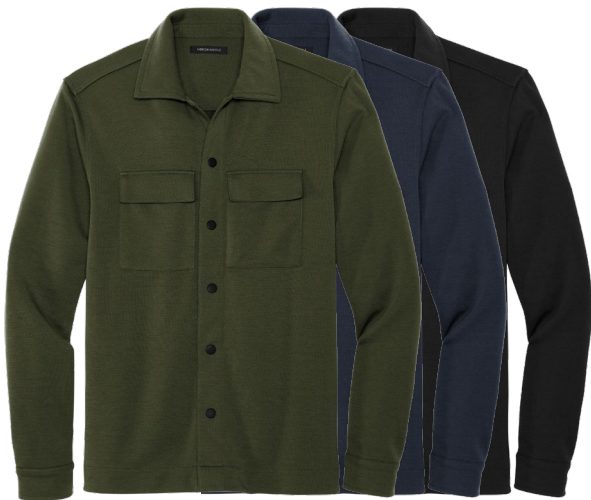
MERCER + METTLE Double-Knit Snap Front Jacket MM3004 Adult Sizes: XS-4XL | 3 colors