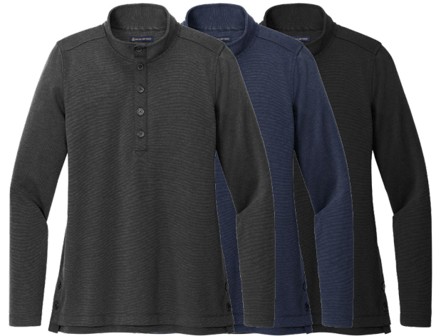
BROOKS BROTHERS Women's Mid-Layer Stretch 1/2 Button BB18203 Women's Sizes: XS-4XL | 3 colors