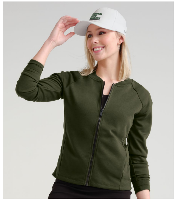
MERCER + METTLE Women's Double-Knit Bomber MM3001 Women's Sizes: XS-4XL | 4 colors Worn with TM1MU426

One size rarely fits all. A modern look represents a cohesive group that gives each member of the team the room to be themselves.