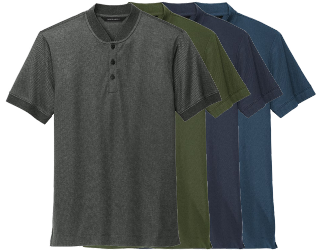
MERCER + METTLE Stretch Pique Henley MM1008 Adult Sizes: XS-4XL | 7 colors