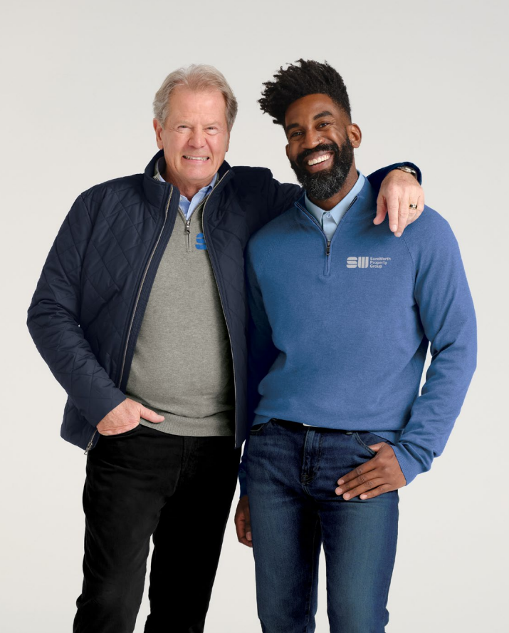
BROOKS BROTHERS Cotton Stretch 1/4-Zip Sweater BB18402 Adult Sizes: XS-4XL | 4 colors