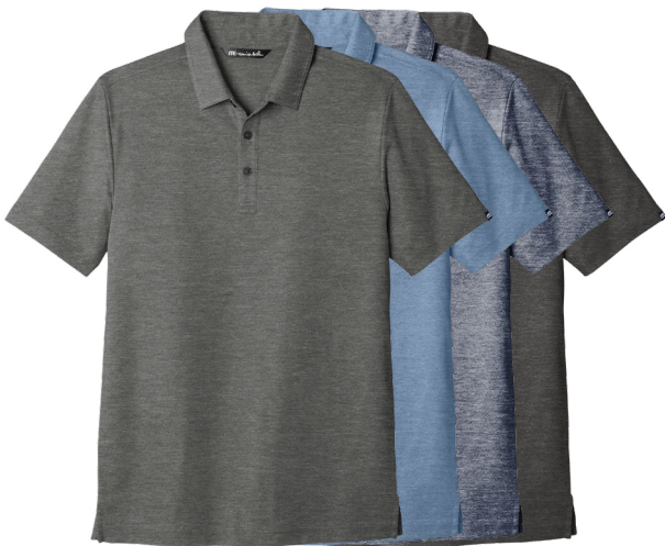
TRAVISMATHEW Oceanside Heather Polo TM1MU412 Adult Sizes: S-3XL | 8 colors