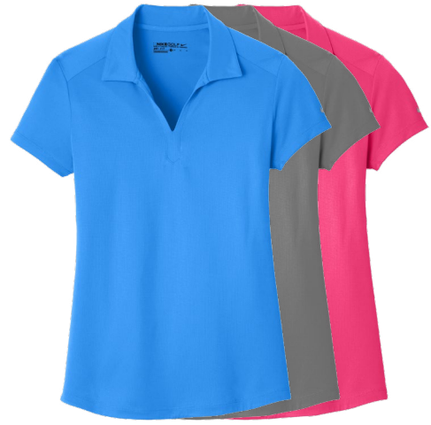
NIKE Ladies Dri-FIT Legacy Polo 838957 Women's Sizes: XS-2XL | 6 colors