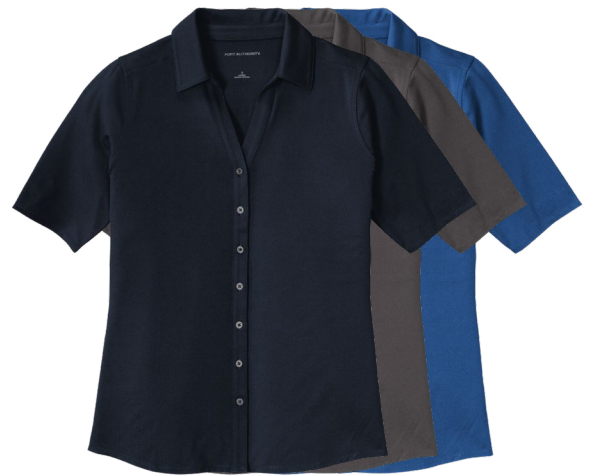
PORT AUTHORITY Ladies City Stretch Top LK682 Women's Sizes: XS-4XL | 5 colors