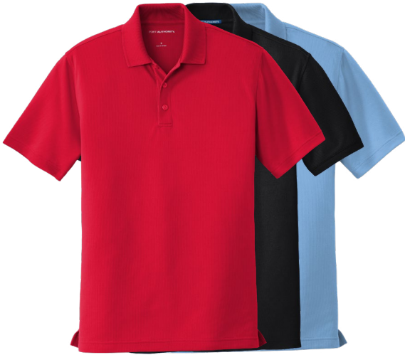
PORT AUTHORITY Dry Zone UV Micro-Mesh Polo K110 Adult Sizes: XS-6XL | 16 colors