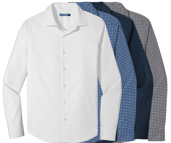
PORT AUTHORITY City Stretch Shirt W680 Adult Sizes: XS-4XL | 5 colors