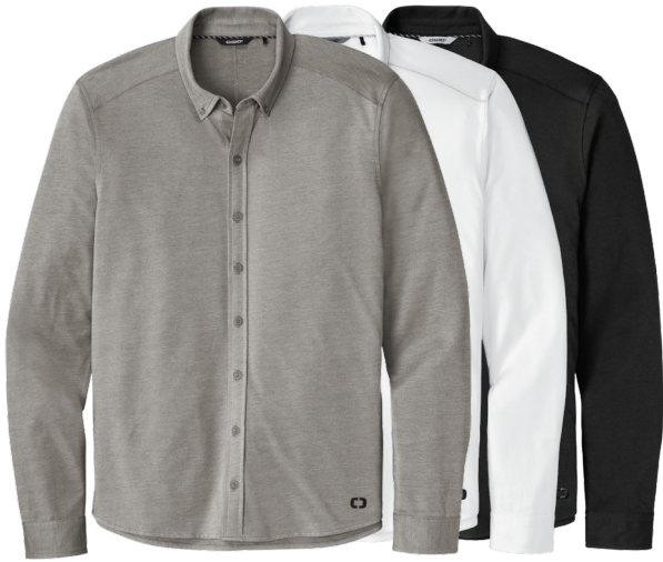
OGIO Code Stretch Long Sleeve Button-Up OG145 Adult Sizes: XS-4XL | 3 colors