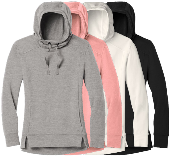
OGIO Ladies Luuma Pullover Fleece Hoodie LOG810 Women's Sizes: XS-4XL | 4 colors