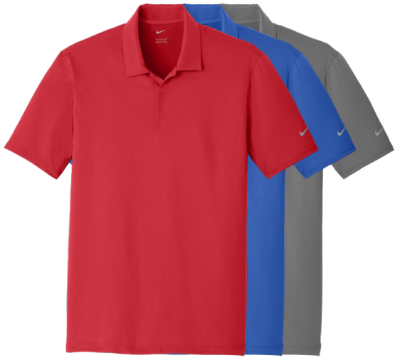
NIKE Dri-FIT Legacy Polo 883681 Adult Sizes: XS-4XL | 6 colors