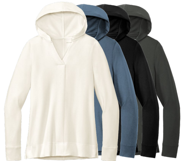
PORT AUTHORITY Ladies Microterry Pullover Hoodie LK826 Women's Sizes: XS-4XL | 4 colors