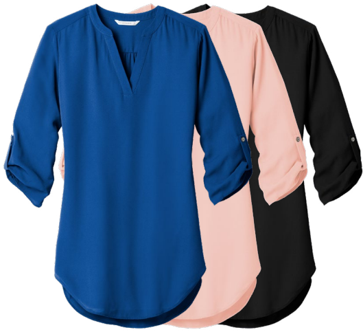
PORT AUTHORITY Ladies 3/4-Sleeve Tunic Blouse LW701 Women's Sizes: XS-4XL | 8 colors

Uplift the whole team with outfits that speak to a cohesive vision, a laid-back attitude and a clear focus on accomplishing great work together.