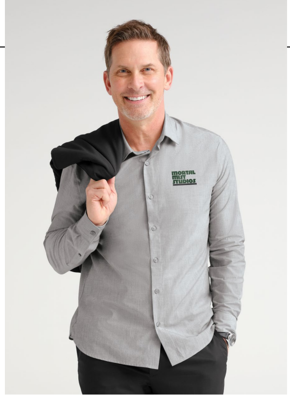
MERCER + METTLE Long Sleeve Stretch Woven Shirt MM2000 Adult Sizes: XS-4XL | 7 colors Worn with TM1MW453