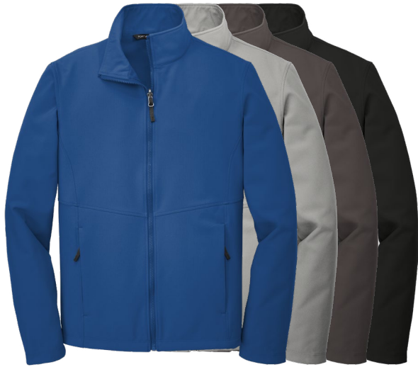
PORT AUTHORITY Collective Soft Shell Jacket J901 Adult Sizes: XS-4XL | 5 colors