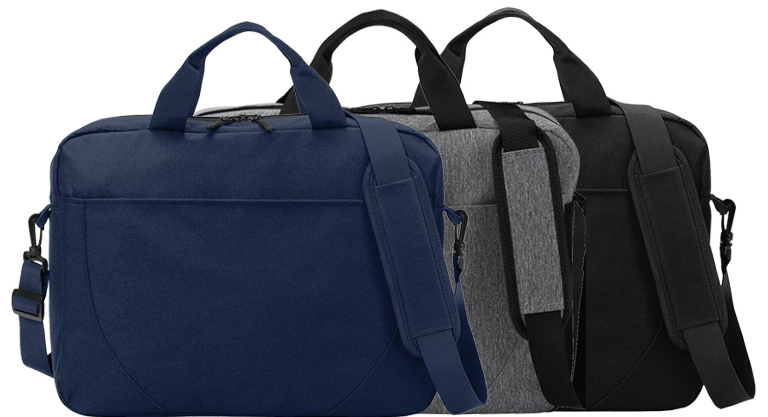
PORT AUTHORITY Access Briefcase BG318 3 colors