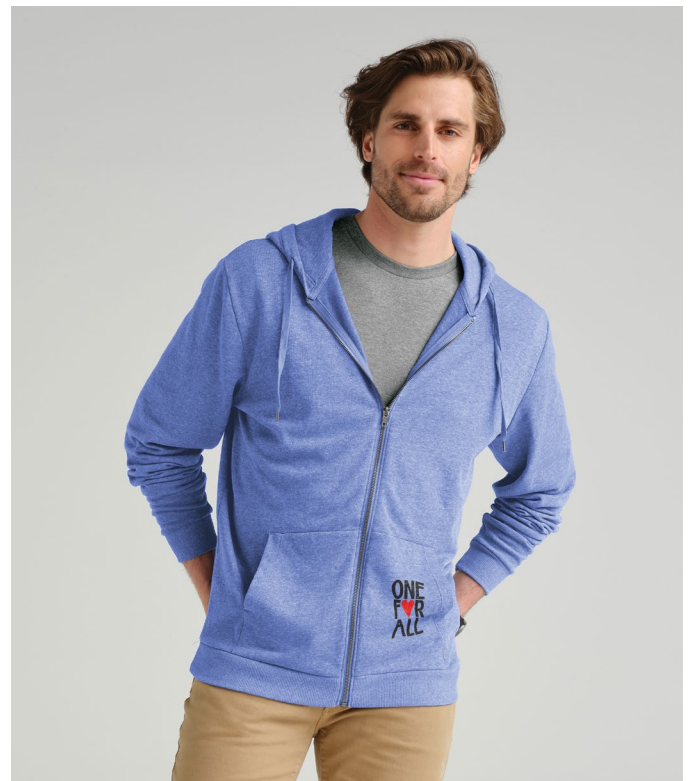
DISTRICT Perfect Tri Fleece Full-Zip Hoodie DT1302 Adult Sizes: XS-4XL | 6 colors Worn with DM130