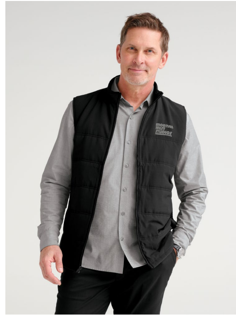
TRAVIS MATHEW Cold Bay Vest TM1MW453 Adult Sizes: S-3XL | 2 colors Worn with MM2000