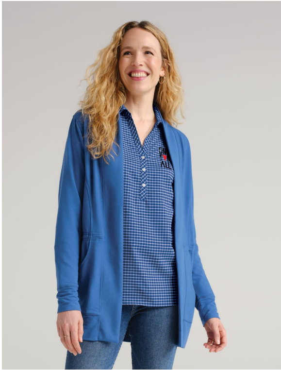
PORT AUTHORITY Ladies Microterry Cardigan LK825 Women's Sizes: XS-4XL | 4 colors Worn with LW680