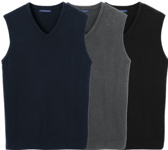
PORT AUTHORITY Sweater Vest SW286 Adult Sizes: XS-4XL | 3 colors