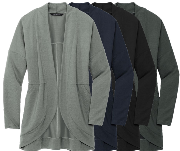
MERCER + METTLE Women's Stretch Open-Front Cardigan MM3015 Women's Sizes: XS-4XL | 4 colors