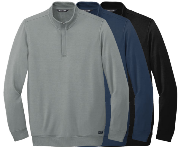
TRAVISMATHEW Newport 1/4-Zip Fleece TM1MU419 Adult Sizes: S-3XL | 3 colors