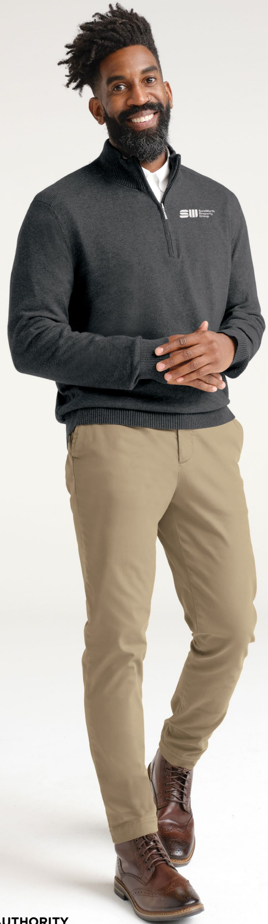
PORT AUTHORITY 1/2-Zip Sweater SW290 Adult Sizes: XS-4XL | 3 colors Worn with BB18002