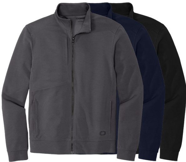
OGIO Hinge Full-Zip OG820 Adult Sizes: XS-4XL | 3 colors