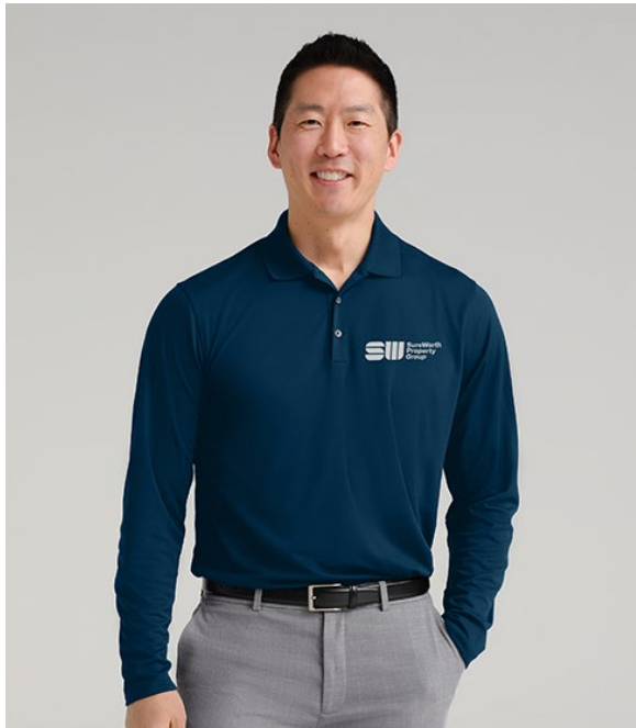
NIKE Dri-FIT Micro Pique 2.0 Long Sleeve Polo NKDC2104 Adult Sizes: XS-4XL | 7 colors