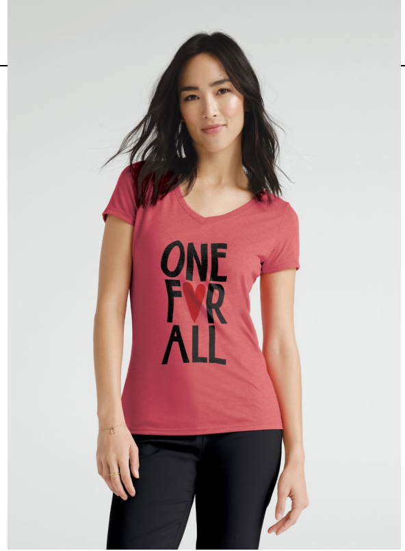
DISTRICT Women's Perfect Tri V-Neck Tee DM1350L Women's Sizes: XS-4XL | 23 colors