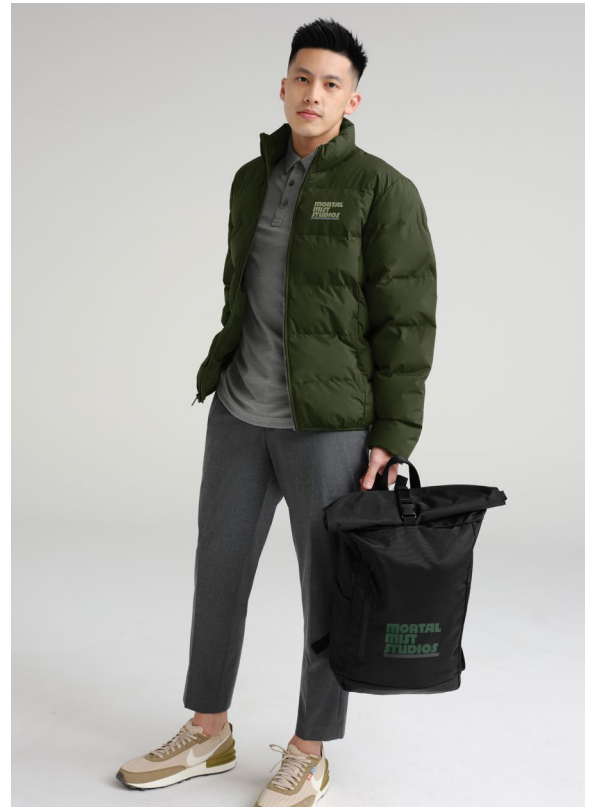
MERCER + METTLE Rucksack MMB201 One Size Fits All | 1 color Worn with TM1MU412, MM7210