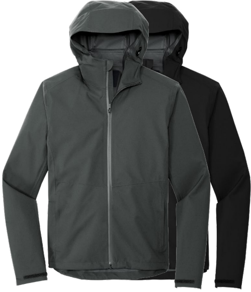
MERCER + METTLE Waterproof Rain Shell MM7000 Adult Sizes: XS-4XL | 2 colors