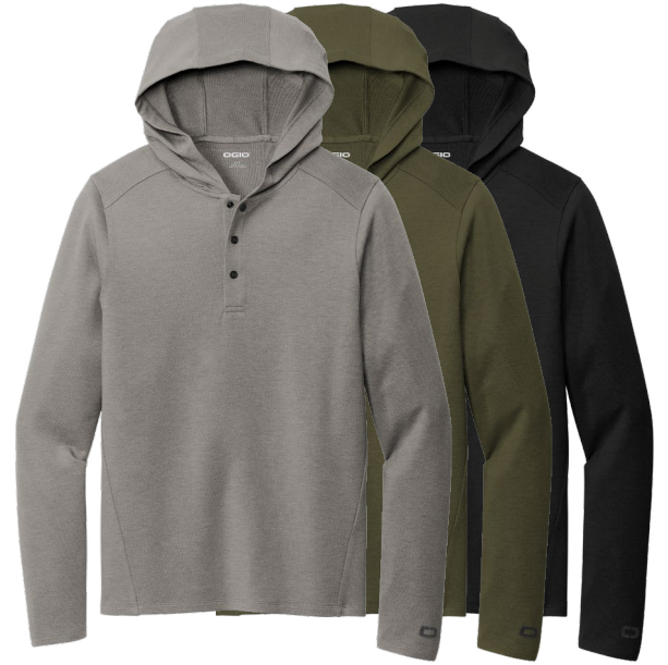
OGIO Luuma Flex Hooded Henley OG826 Adult Sizes: XS-4XL | 3 colors