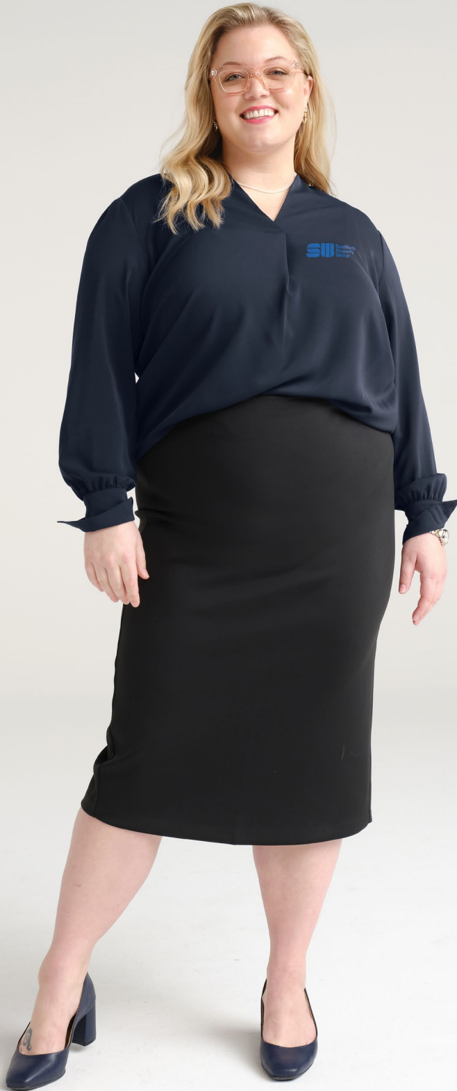
BROOKS BROTHERS Women's Open-Neck Satin Blouse BB18009 Women's Sizes: XS-4XL | 4 colors

Buttoned-up should not mean boring. A true classic look brings the team together with a sense of professionalism and pride.