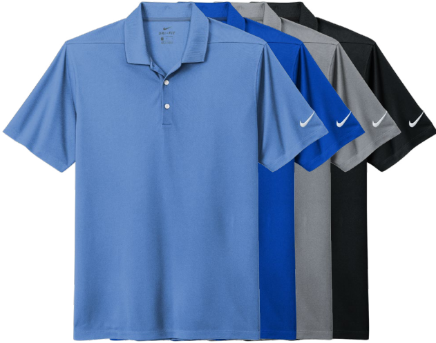
NIKE Dri-FIT Micro Pique 2.0 Polo NKDC1963 Adult Sizes: XS-4XLT | 20 colors