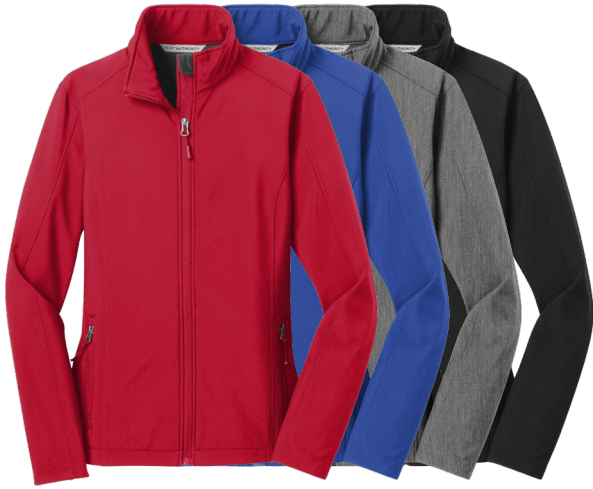
PORT AUTHORITY Ladies Core Soft Shell Jacket L317 Women's Sizes: XS-4XL | 10 colors