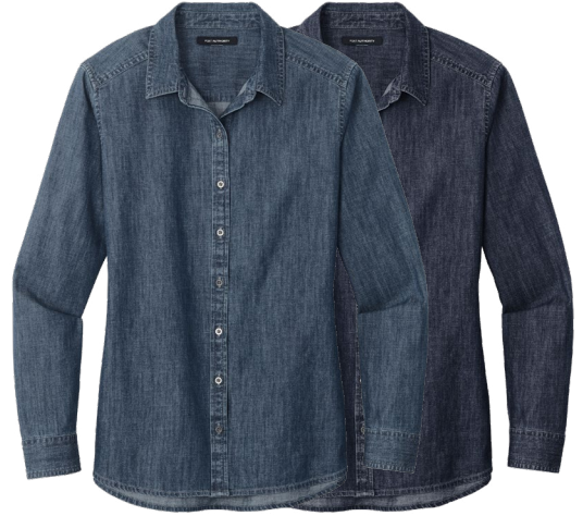
PORT AUTHORITY Ladies Long Sleeve Perfect Denim Shirt LW676 Women's Sizes: XS-4XL | 2 colors