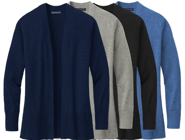
BROOKS BROTHERS Women's Cotton Stretch Long Cardigan Sweater BB18403 Women's Sizes: XS-4XL | 4 colors