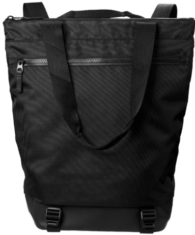
MERCER + METTLE Convertible Tote MMB202 1 color