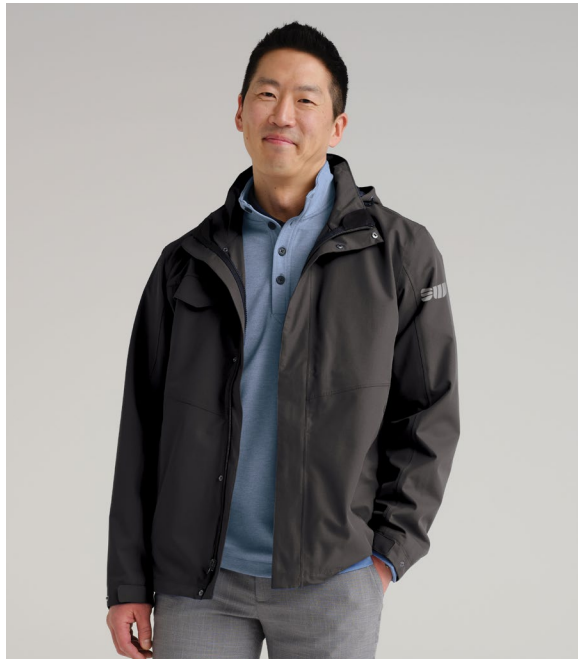
PORT AUTHORITY Collective Outer Shell Jacket J900 Adult Sizes: XS-4XL | 4 colors Worn with NKDC2104, BB18202