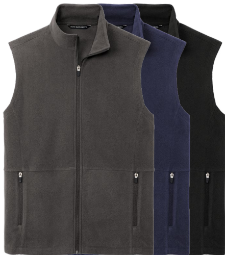
PORT AUTHORITY Accord Microfleece Vest F152 Adult Sizes: XS-4XL | 3 colors