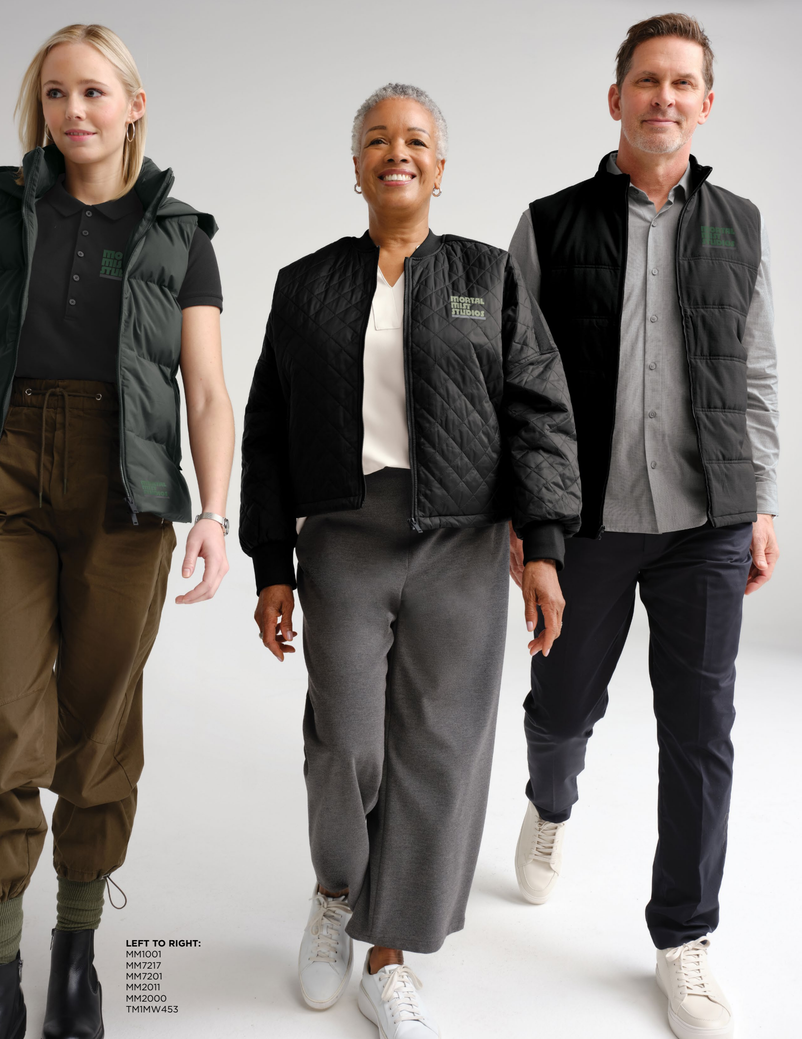
LEFT TO RIGHT: MM1001 MM7217 MM7201 MM2011 MM2000 TMIMW453