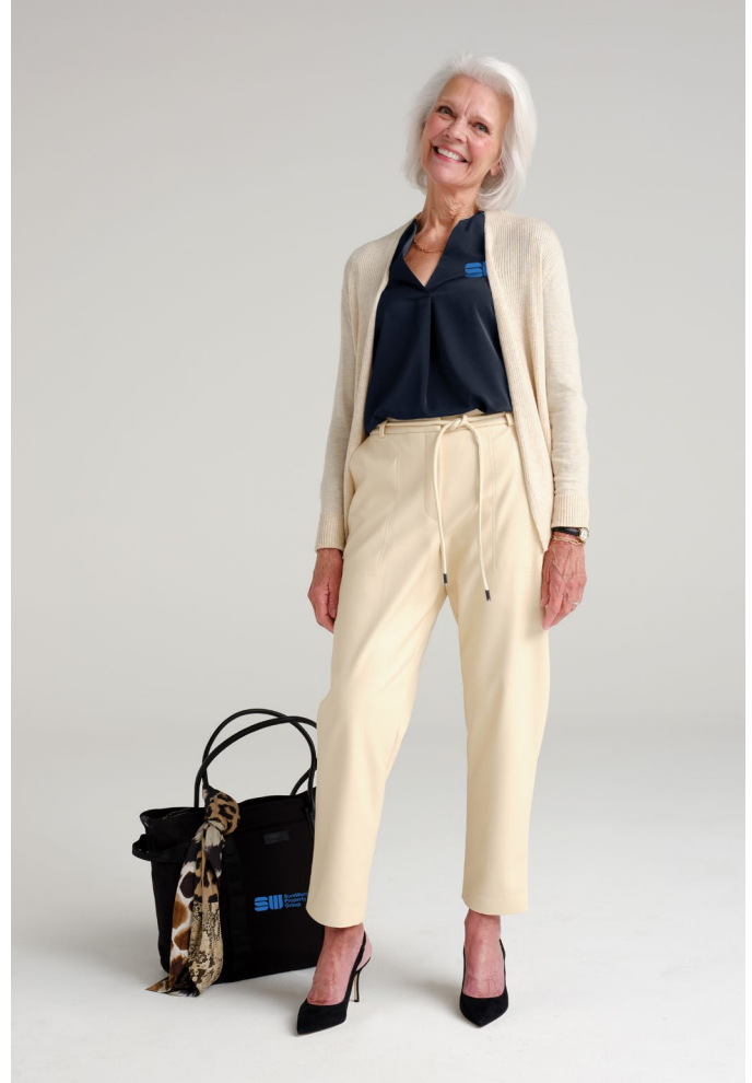
BROOKS BROTHERS Wells Laptop Tote BB18840 2 colors Worn with BB18009, LSW289