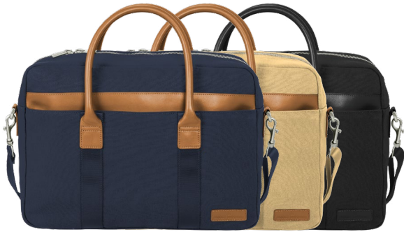
BROOKS BROTHERS Wells Briefcase BB18830 3 colors