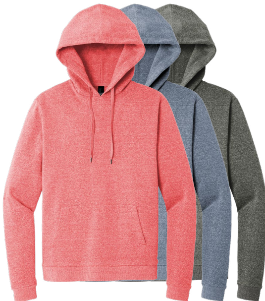
DISTRICT Perfect Tri Fleece Pullover Hoodie DT1300 Adult Sizes: XS-4XL | 12 colors