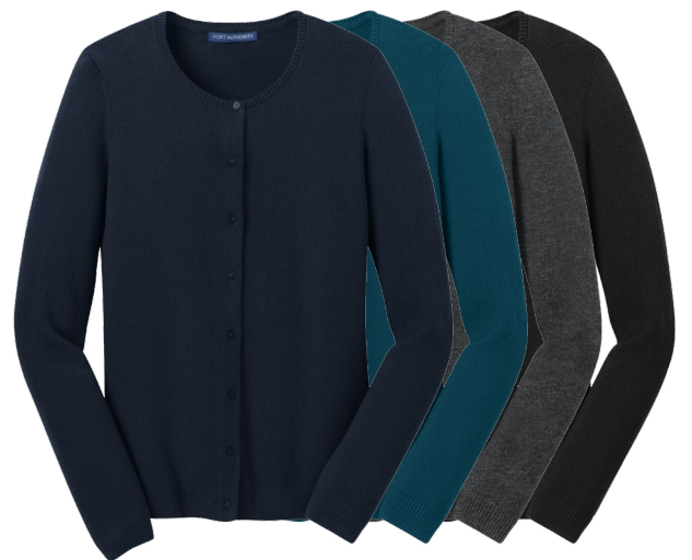
PORT AUTHORITY Ladies Cardigan Sweater LSW287 Women's Sizes: XS-4XL | 3 colors