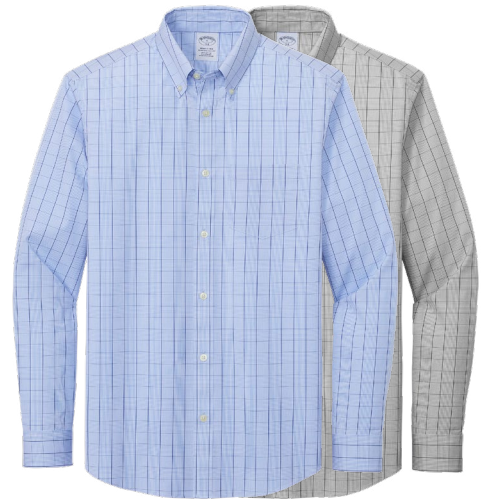
BROOKS BROTHERS Wrinkle Free Stretch Patterned Shirt BB18008 Adult Sizes: XS-4XL | 2 colors

Buttoned-up should not mean boring. A true classic look brings the team together with a sense of professionalism and pride.