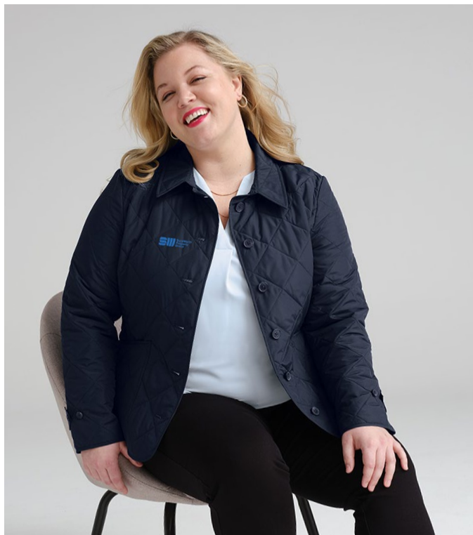
BROOKS BROTHERS Women's Quilted Jacket BB18601 Women's Sizes: XS-4XL | 2 colors Worn with BB18009