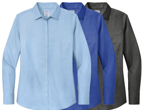
BROOKS BROTHERS Wrinkle Free Women's Stretch Nailhead Shirt BB18003 Women's Sizes: XS-4XL | 6 colors