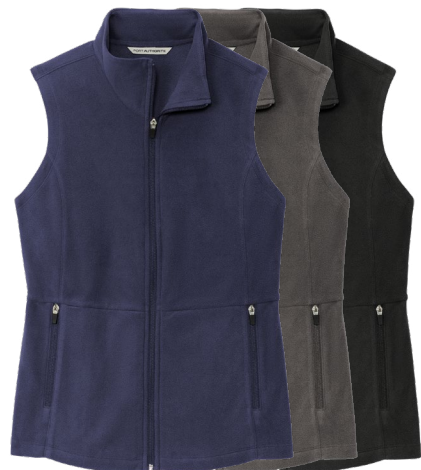
PORT AUTHORITY Ladies Accord Microfleece Vest L152 Women's Sizes: XS-4XL | 3 colors