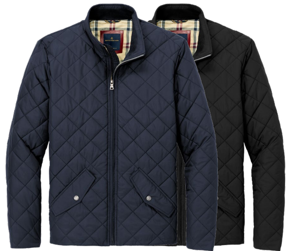
BROOKS BROTHERS Quilted Jacket BB18600 Adult Sizes: XS-4XL | 2 colors