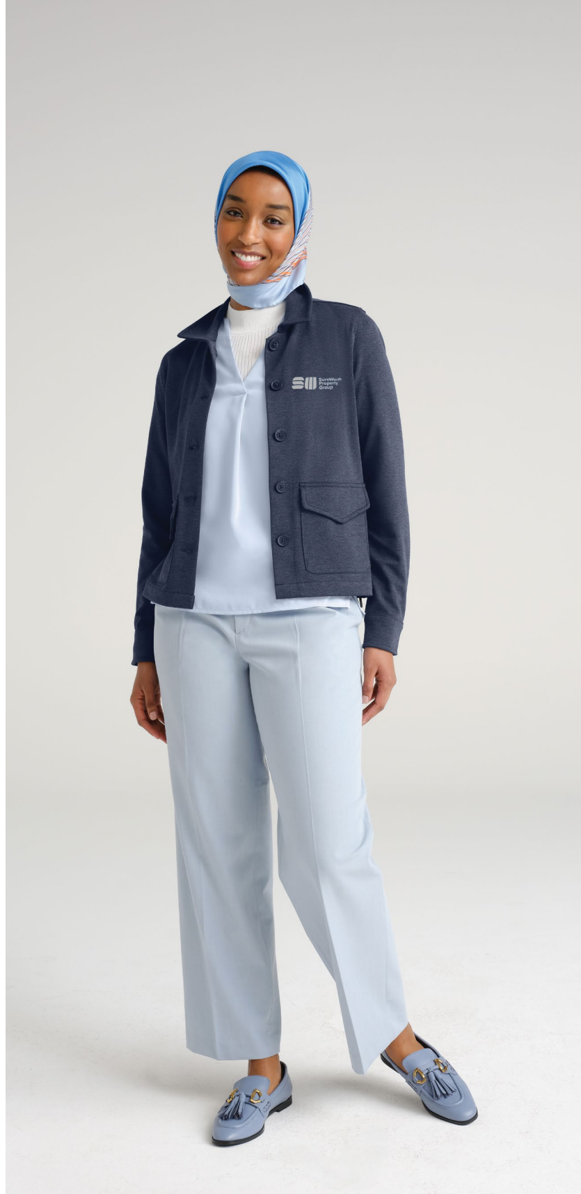
BROOKS BROTHERS Women's Mid-Layer Stretch Button Jacket BB18205 Women's Sizes: XS-4XL | 3 colors Worn with BB18009