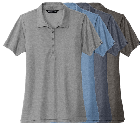
TRAVISMATHEW Ladies Oceanside Heather Polo TM1WW002 Women's Sizes: S-2XL | 6 colors