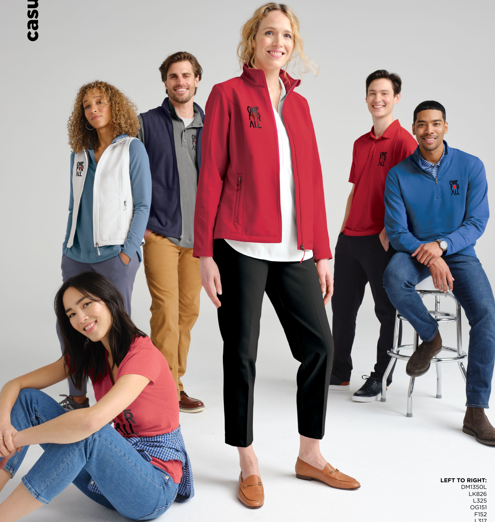
LEFT TO RIGHT: DM1350L LK826 L325 OG151 F152 L317 LW680 883681 K825 W680