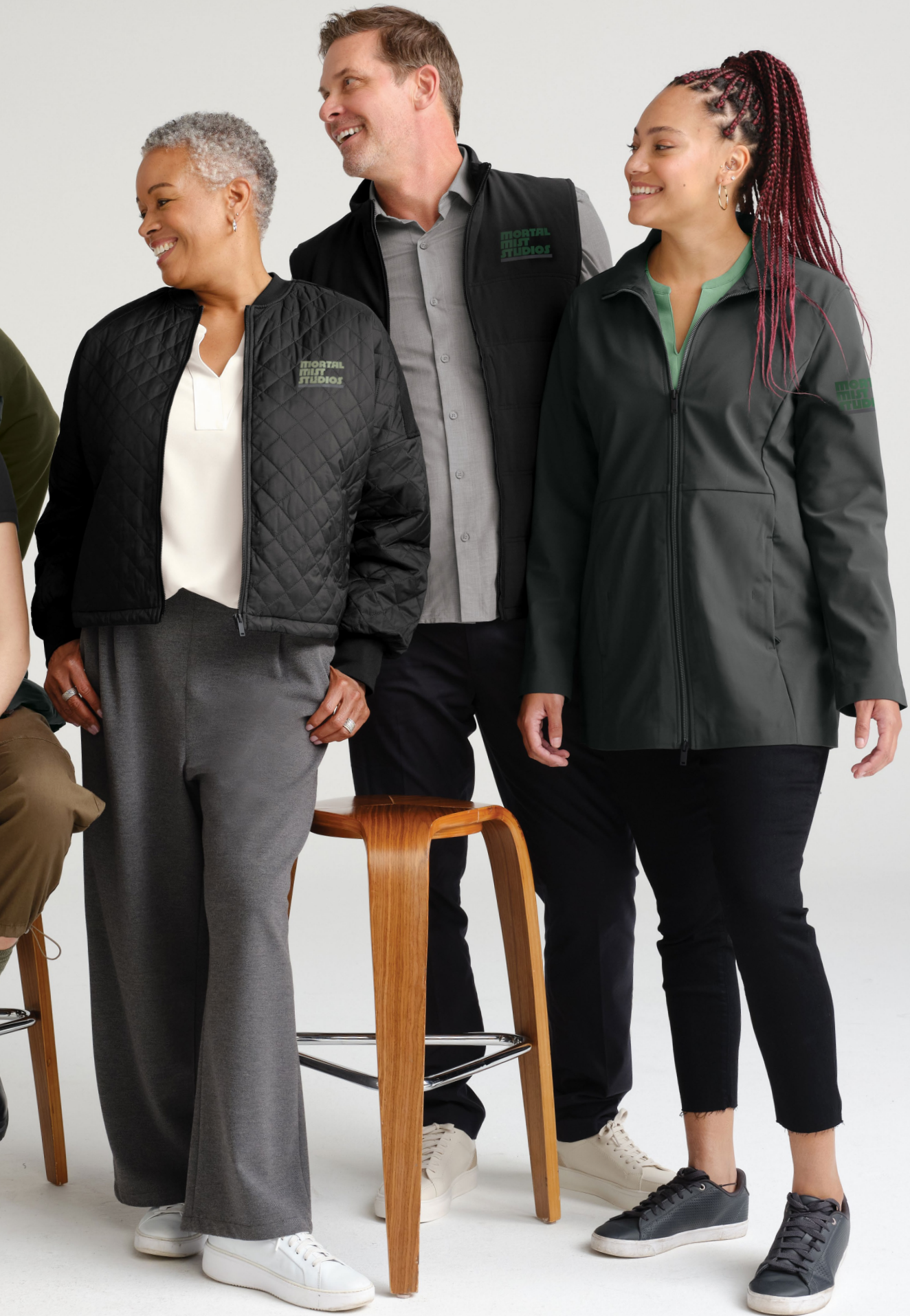
LEFT TO RIGHT: MM1006 MM3000 OG826 MM1001 MM7217 MM7201 MM2011 MM2000 TMIMW453 MM7101 MM2011