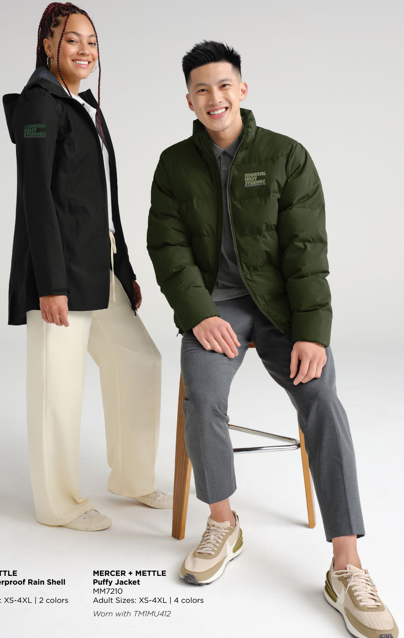
MERCER + METTLE Women's Waterproof Rain Shell MM7001 Women's Sizes: XS-4XL | 2 colors