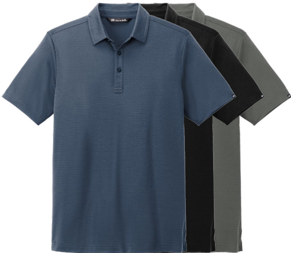
TRAVISMATHEW Bayfront Solid Polo TM1MY399 Adult Sizes: S-3XL | 4 colors