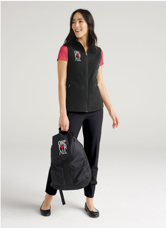
OGIO Evolution Pack 91015 4 colors