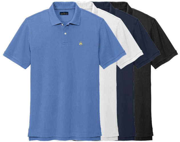
BROOKS BROTHERS Pima Cotton Pique Polo BB18200 Adult Sizes: XS-4XL | 6 colors