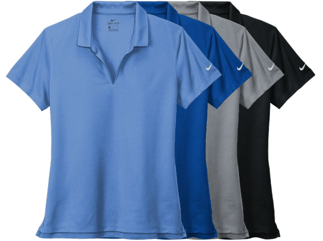
NIKE Ladies Dri-FIT Micro Pique 2.0 Polo NKDC1991 Women's Sizes: S-2XL | 20 colors