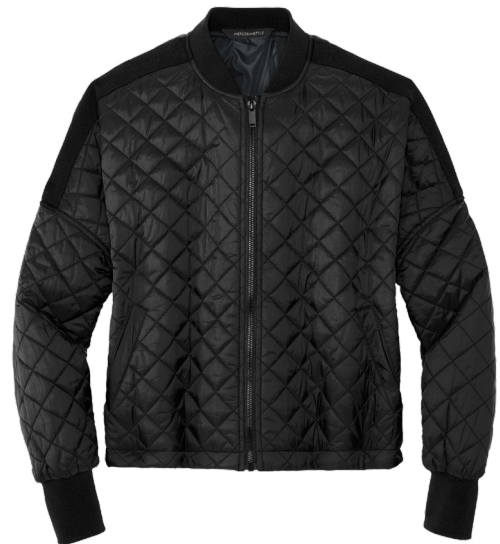
MERCER + METTLE Women's Boxy Quilted Jacket MM7201 Women's Sizes: XS-4XL | 1 color