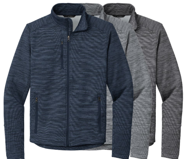
PORT AUTHORITY Digi Stripe Fleece Jacket F231 Adult Sizes: XS-4XL | 3 colors