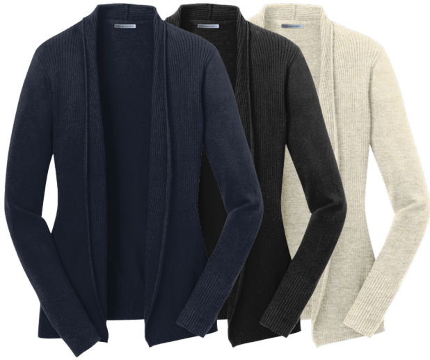
PORT AUTHORITY Ladies Open Front Cardigan Sweater LSW289 Women's Sizes: XS-4XL | 4 colors