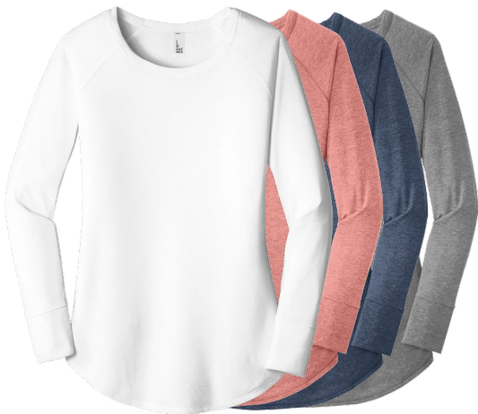
DISTRICT Women's Perfect Tri Long Sleeve Tunic Tee DT132L Women's Sizes: XS-4XL | 5 colors

Uplift the whole team with outfits that speak to a cohesive vision, a laid-back attitude and a clear focus on accomplishing great work together.