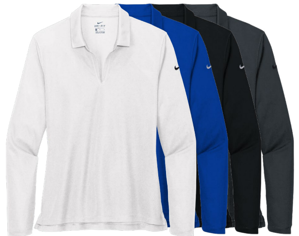
NIKE Ladies Dri-FIT Micro Pique 2.0 Long Sleeve Polo NKDC2105 Women's Sizes: S-2XL | 7 colors