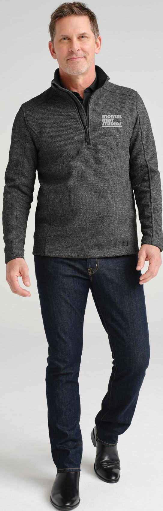
OGIO Grit Fleece 1/2-Zip OG729 Adult Sizes: XS-4XL | 2 colors Worn with TM1MY399