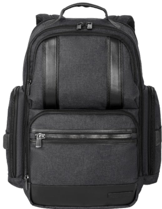
BROOKS BROTHERS Grant Backpack BB18820 1 color