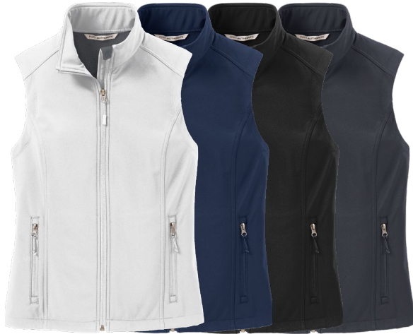
PORT AUTHORITY Ladies Core Soft Shell Vest L325 Women's Sizes: XS-4XL | 5 colors