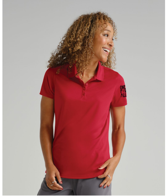
PORT AUTHORITY Ladies Dry Zone UV Micro-Mesh Polo LK110 Women's Sizes: XS-4XL | 16 colors