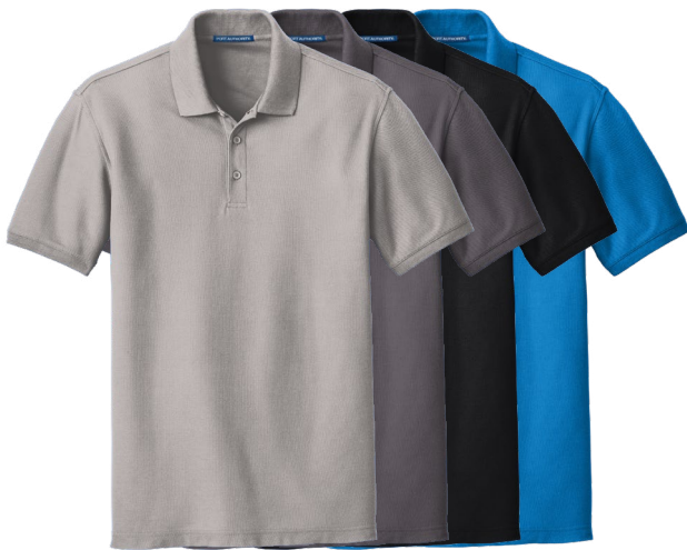
PORT AUTHORITY Core Classic Pique Polo K100 Adult Sizes: XS-6XL | 12 colors