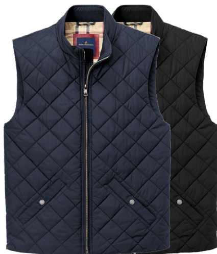
BROOKS BROTHERS Quilted Vest BB18602 Adult Sizes: XS-4XL | 2 colors