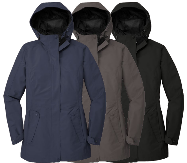
PORT AUTHORITY Ladies Collective Outer Shell Jacket L900 Women's Sizes: XS-4XL | 4 colors