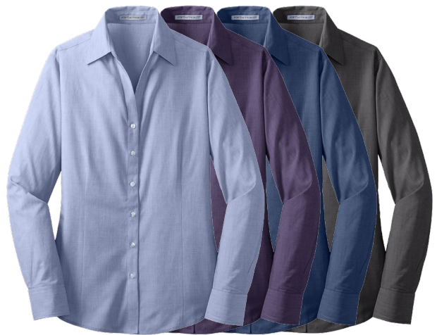
PORT AUTHORITY Ladies Crosshatch Easy Care Shirt L640 Women's Sizes: XS-4XL | 4 colors