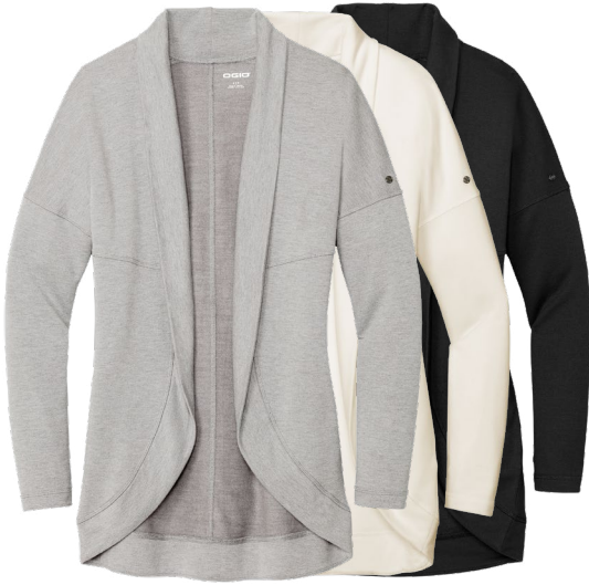
OGIO Ladies Luuma Coccoon Fleece LOG811 Women's Sizes: XS-4XL | 3 colors