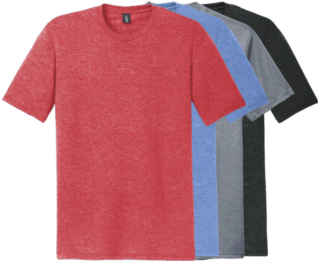
DISTRICT Perfect Tri Tee DM130 Adult Sizes: XS-4XL | 35 colors