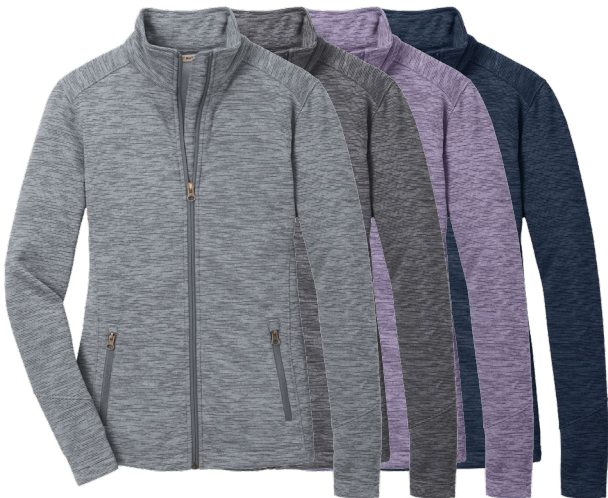
PORT AUTHORITY Ladies Digi Stripe Fleece Jacket L231 Women's Sizes: XS-4XL | 4 colors