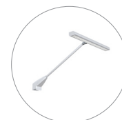
LED light kit (Optional)