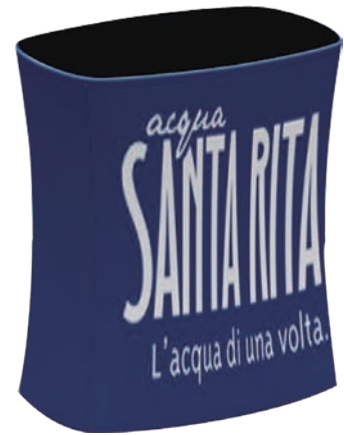
Assembled frame with graphic