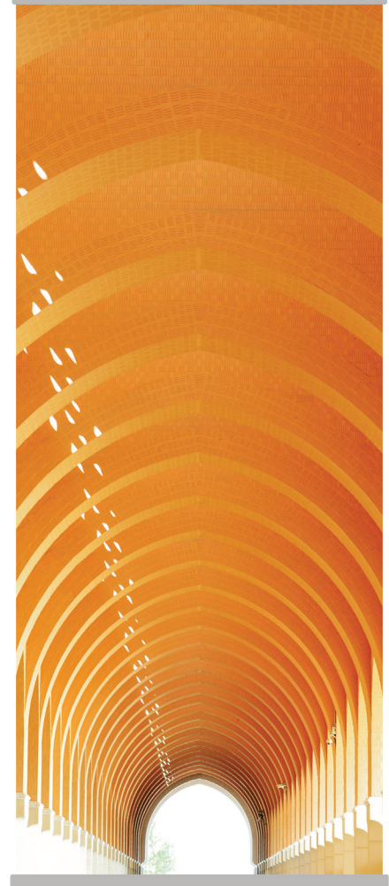
(Optional) MAGNETIC TOP CLAMP CONNECTOR CAT-DRAMCS