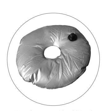
Water bag to provide additional weight (for use with X-base)