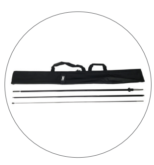
Durable fiberglass-graphite composite pole set with carrying case included