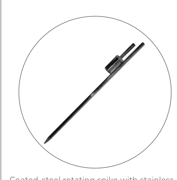
Coated-steel rotating spike with stainless steel bearings for in-ground application