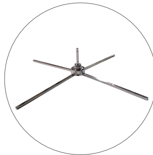
Heavy-duty X-base for indoor or flat surface environments