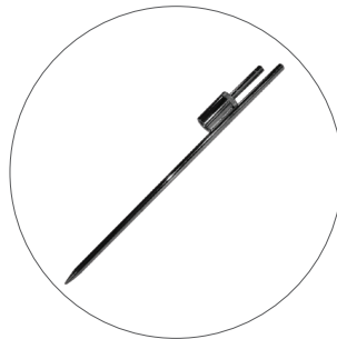
Coated-steel rotating spike with stainless steel bearings for in-ground application