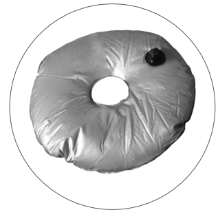
Water bag to provide additional weight (for use with X-base)