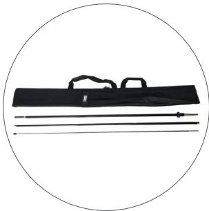
Durable fiberglass-graphite composite pole set with carrying case included