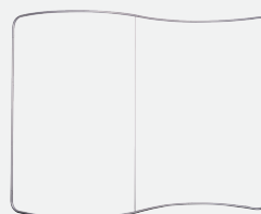
Frame and Feet