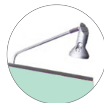
universal light kit