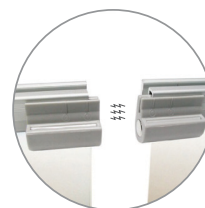
magnetic top clamp connector