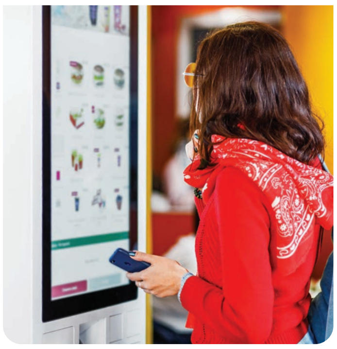
▼ Makes screens, doors and panels safer to touch