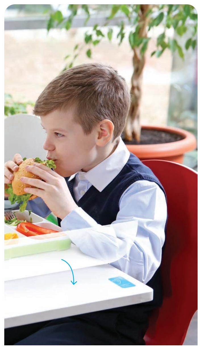
Added protection for tables, desks and counters