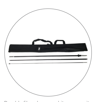
Durable fiberglass-graphite composite pole set with carrying case included