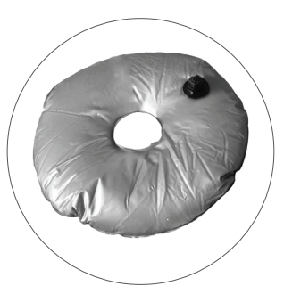
Water bag to provide additional weight (for use with X-base)