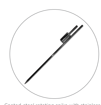
Coated-steel rotating spike with stainless steel bearings for in-ground application