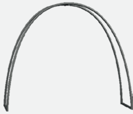
Collapsible Aluminum Frame