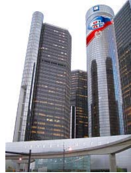
Infinite Scale Design Group Please see Super Bowl on D11

An artist's drawing of the building wrap to be installed on the GM Renaissance Center in Detroit for Super Bowl XL.